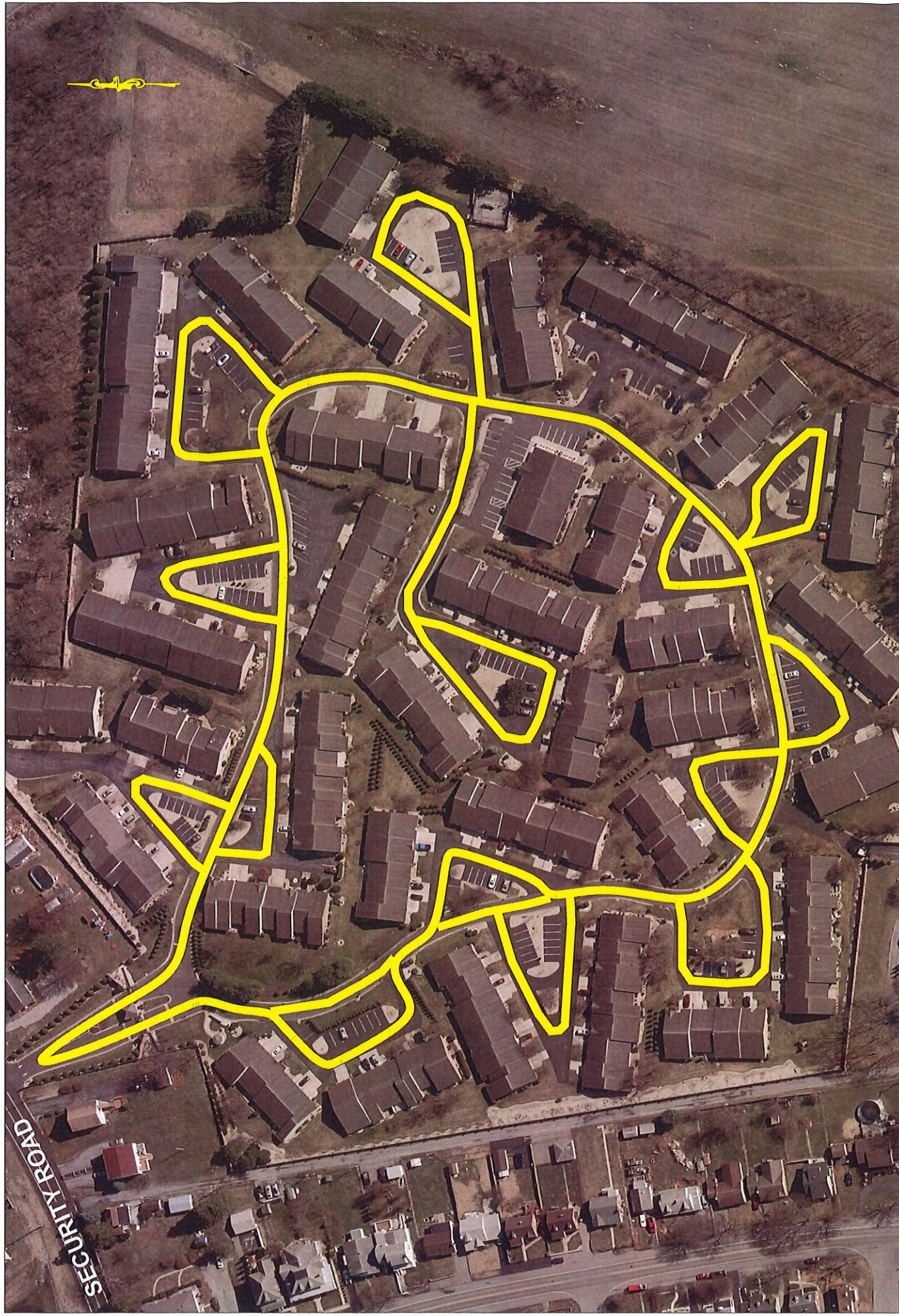
EXHIBIT "A": SUMMERLAND MANOR STREETS AND COURTS TO BE ACCESSED BY SOLID WASTE COLLECTION CONTRACTOR