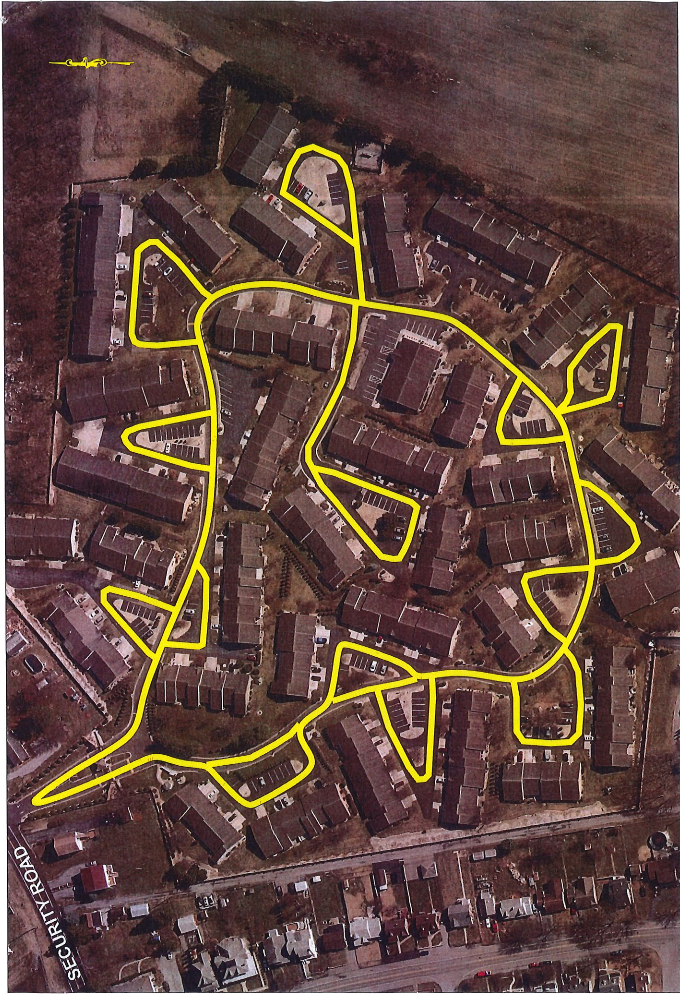
EXHIBIT "A": SUMMERLAND MANOR STREETS AND COURTS TO BE ACCESSED BY SOLID WASTE COLLECTION CONTRACTOR